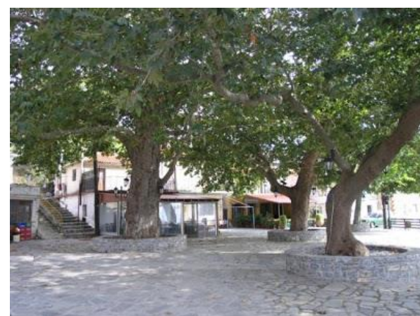
The Varvitsas' square