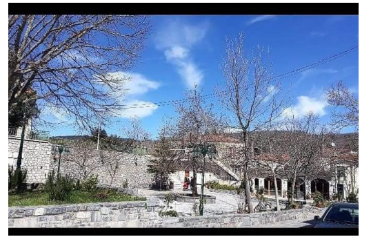
The Central square in a sunny winter day