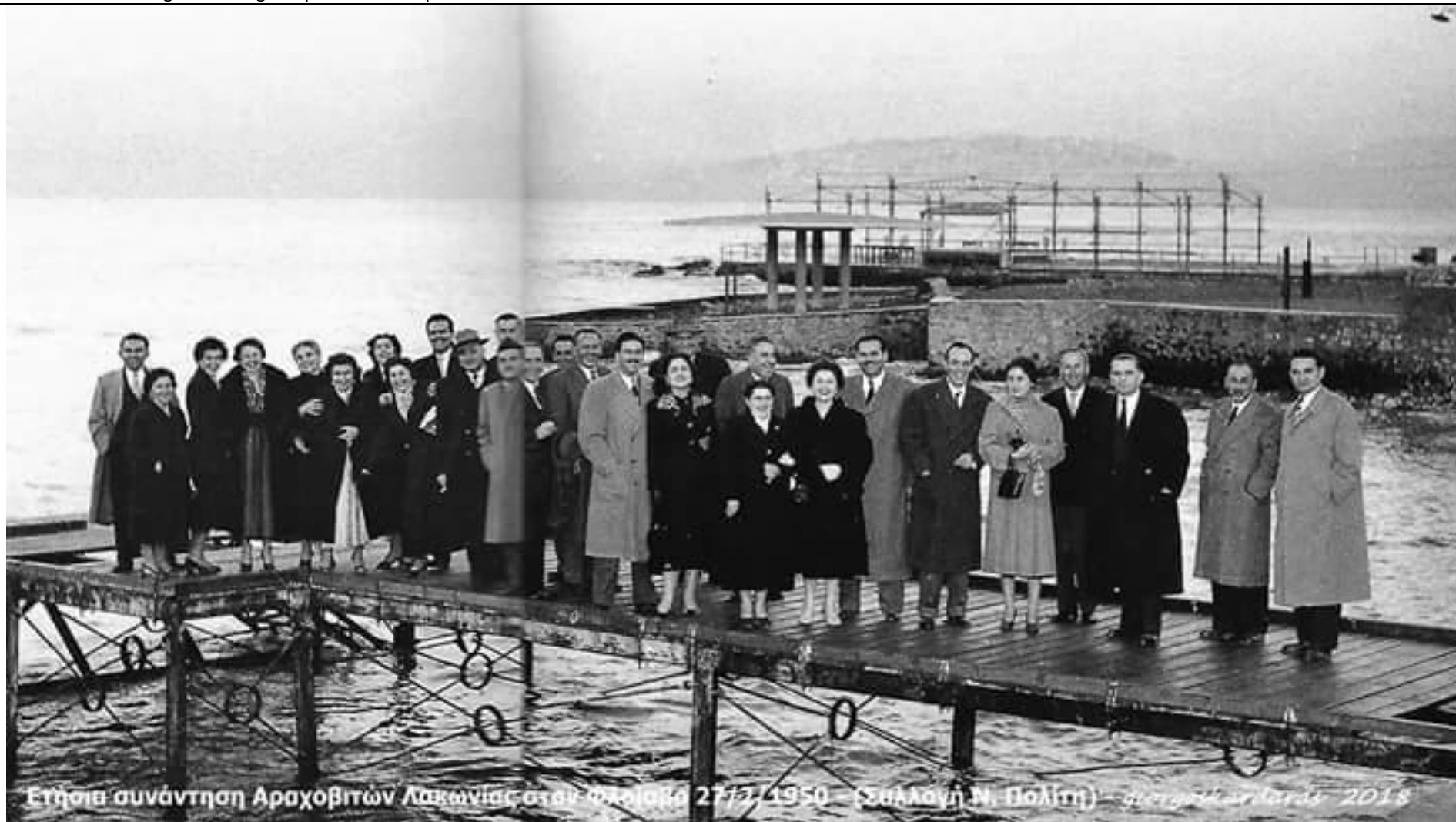
Ετήσια συνάντηση Αραχοβιτών Λακωνίας στον Φαλίβο 27/2/1950 - Ημερομηνία 2018

Many will be able to recognize their grandparents in the picture.