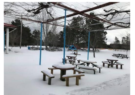
A WINTER VIEW OF OUR PARK