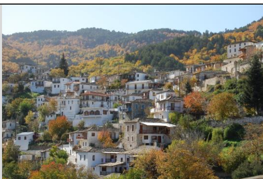
View of Kastanitsa